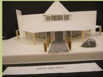
Left: Design from local high school students for a community center in Middle Main.