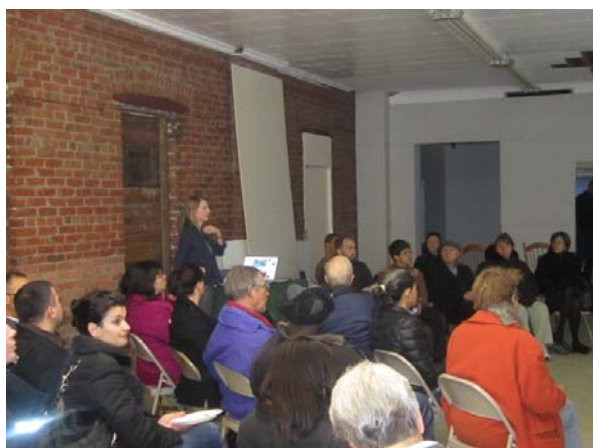
Top: Middle Main Steering Committee at Tree Lighting Middle: Middle Main hosts a Happy Hour at The Nuddy Bar & Grill Bottom: March 2011 Monthly Community Meeting