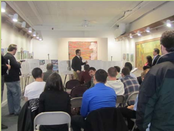
Above and bottom right: The Architecture Faculty at Dutchess Community College hosted design presentations for a vacant lot on Main Street, Poughkeepsie, as part of the school's Architectural Technology and Construction Technology Capstone course.

These two events were great means for students to explore their interest in architecture and begin to hone their skills, and it offered Middle Main Revitalization a fresh and exciting perspective on new development. If you missed these events, join us on June 8th as we host students from City University of New York, who have spent the past semester developing conceptual plans for the redevelopment of Rose Street in Poughkeepsie. The presentations will be part of our monthly Middle Main Community Meeting, and will take place at 505 Main Street at 5:30pm. For more information, visit www.middlemain.com .